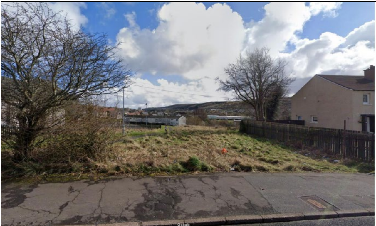
View from Auchmead Road towards the site looking east

The site is located within the existing settlement boundary of Greenock as identified under Policy 20 of the proposed Local Development Plan. As such this site is considered to be in a sustainable location and therefore the proposal accords in general terms with the Spatial Development Strategy. Policy 20 of the proposed Local Development Plan requires development within residential areas to be assessed with regard to impact on the amenity, character and appearance of the area. The surrounding area is residential in character in which there are a variety of house types and styles.