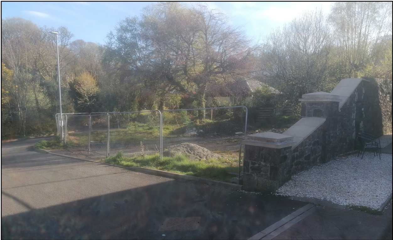
Photo from entrance of Langhouse Mews facing north-east across site.

In considering the impacts of the proposal on drainage, Policy 9 of the adopted LDP and Policy 10 of the proposed LDP state that new development proposals which require surface water to be drained should demonstrate that this will be achieved during construction and once completed through a Sustainable Drainage System (SuDS), unless the proposal is for a single dwelling or the discharge is directly to coastal waters. The Head of Service – Roads and Transportation has confirmed that the proposal does not raise concerns that would require a Drainage Impact Assessment to be provided. Regarding the advice given in relation to surface water run-off, this is relevant for the proposed driveway and can be addressed by a condition, should planning permission be granted. The proposal can be implemented without creating conflict with adjacent uses in terms of flooding.