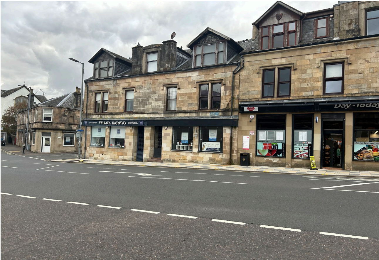
View of the premises from Bridge of Weir Road

In terms of residential amenity, there are a wide range of commercial uses within the local centre and the site is located in close proximity to a busy road where background noise levels, particularly from traffic, are generally higher. The proposed use is therefore considered to accord with the quality of being "Safe and Pleasant" under Policy 1 of both the adopted and proposed Local Development Plans, alongside it being necessary for a planning condition prohibiting the playing of live music and karaoke within the premises.