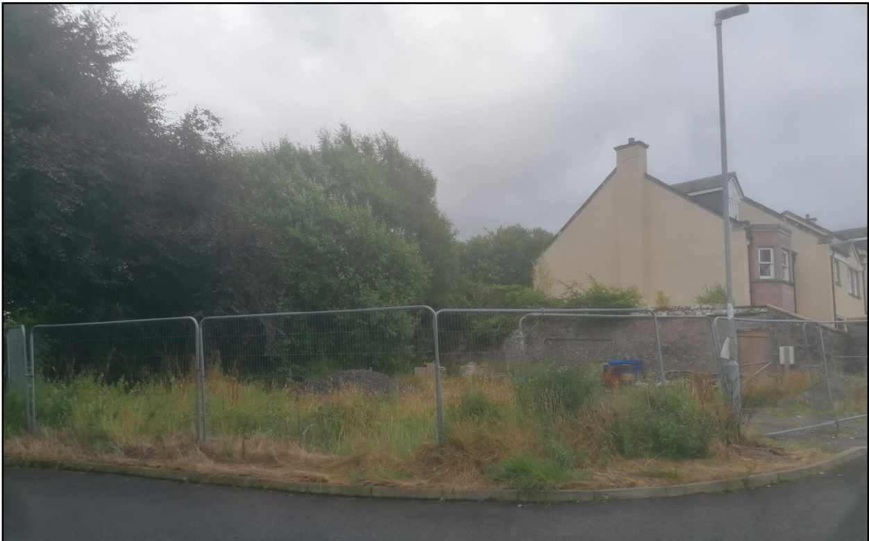
Photo taken from the north-west of the site looking south-east across the site.

Both PAAN 3s consider the proposal as a small-scale single plot infill development. For small-scale infill developments, these should accord with the established density and pattern of development in the immediate vicinity with reference to front and rear garden sizes and distances to plot boundaries. In all instances the minimum window to window distances should be achieved.