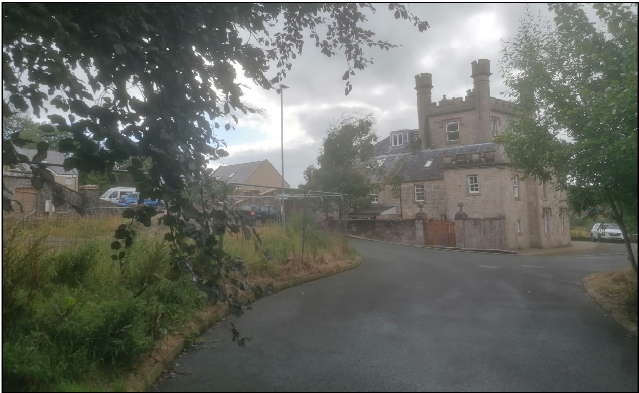
Photo from Langhouse Road at the bend in the road north of the site and facing south-west towards The Langhouse.

It is noted that a planning condition was included in planning permission IC/04/284 which removed householder permitted development rights in respect of the houses constructed under this permission. The purpose of the condition is to retain control over works that otherwise would be "permitted development" thus ensuring the setting of the landscape of The Langhouse is protected from unsympathetic development. Given the proximity of the development to The Langhouse it is considered necessary to attach a similarly worded condition, should planning permission be granted.